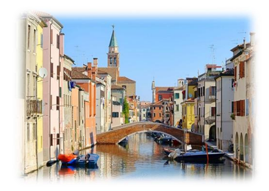
DAY 13: everyone heads back home

DAY 12: Full day of riding with lots of pits stops as we head towards Venice. We will follow the shore line. We will stop to have lunch in a fishing town on the Adriatic Sea. Pass thru the town of Comacchio (little Venice) We will have our farewell dinner in Venice.