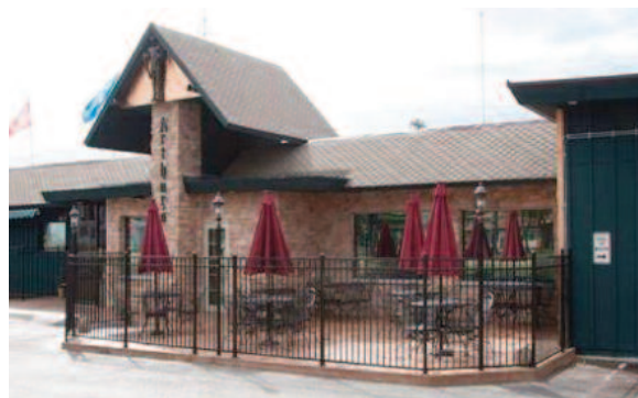
Excellent Steaks, Seafood and Cheese.