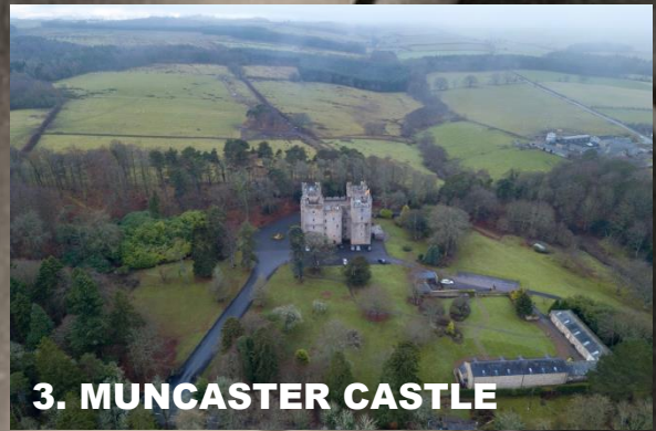
3. MUNCASTER CASTLE