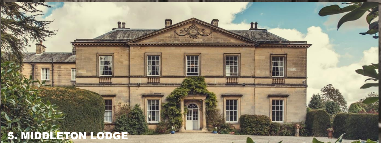
5. MIDDLETON LODGE