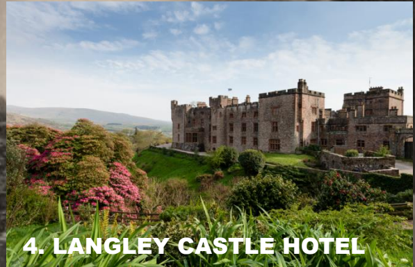
4. LANGLEY CASTLE HOTEL