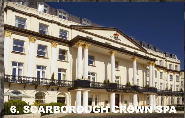
6. SCARBOROUGH CROWN SPA