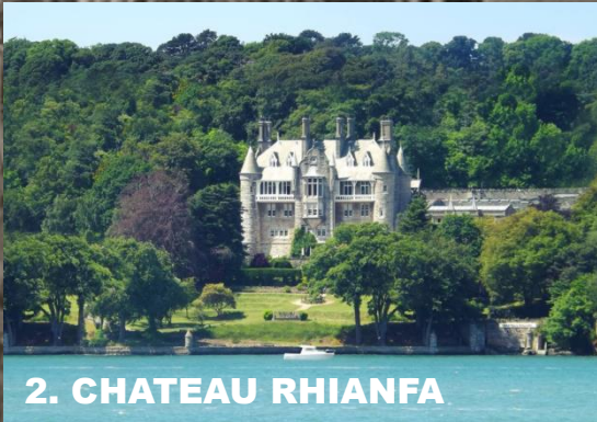
2. CHATEAU RHIANFA