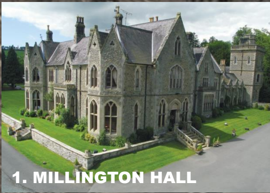
1. MILLINGTON HALL