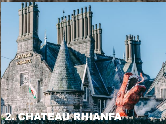
2. CHATEAU RHIANFA