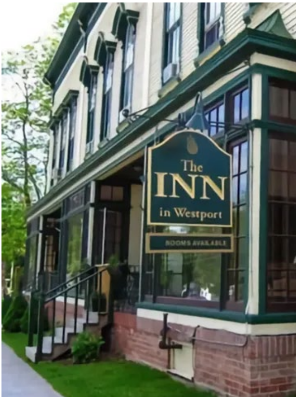
The Inn Westport, NY on Lake Champlain